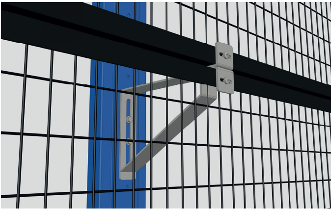
Example of applications of the Screen system of an automatic warehouse developed by Automha SpA.