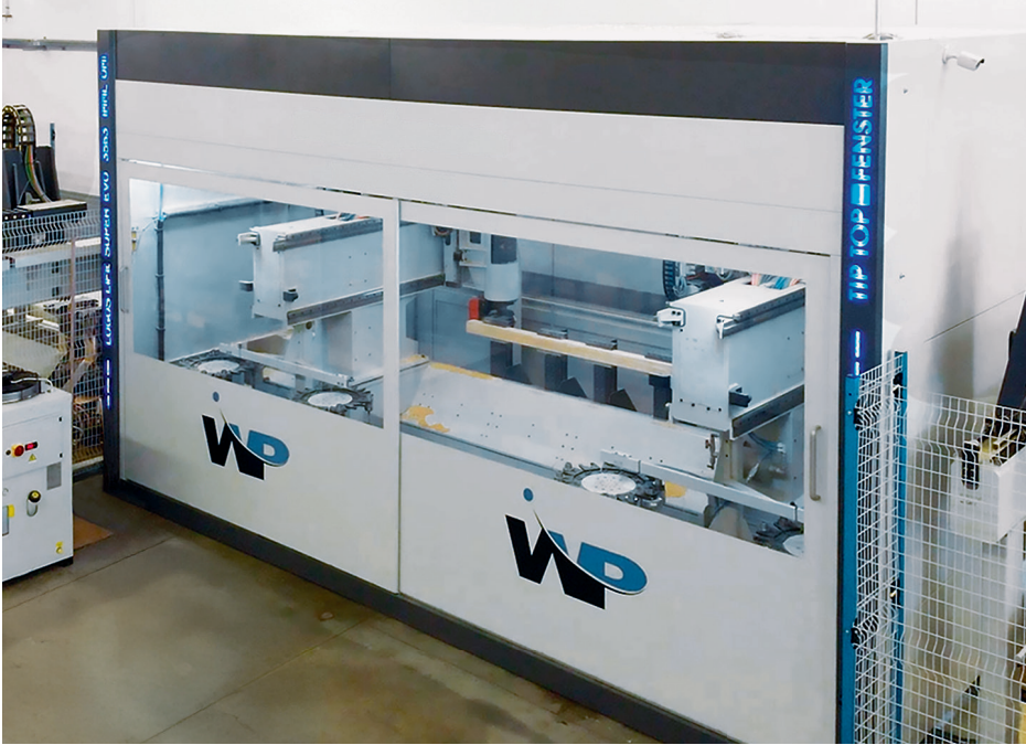
Example of application of a cabin with double front opening.